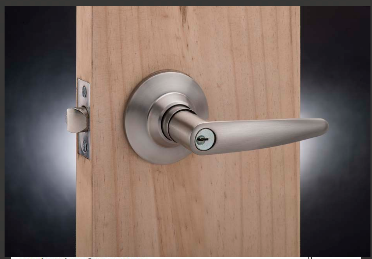
Product Photo & Dimension: